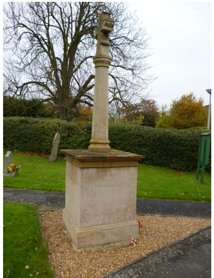
West and South base (both blank)