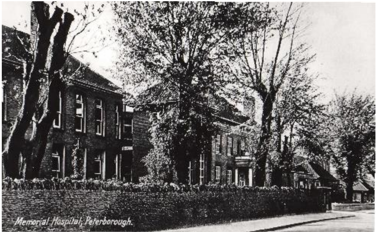
Memorial Hospital, Peterborough.