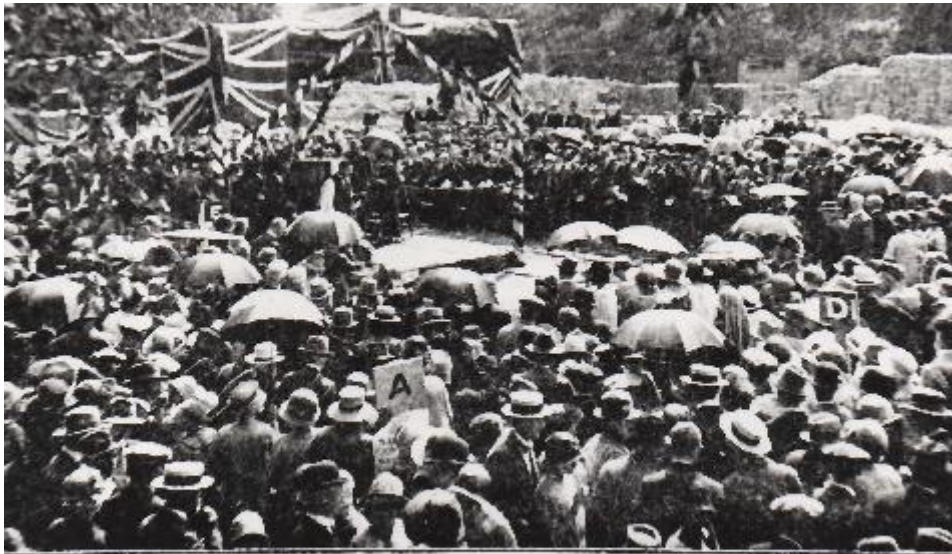
THE STONE-LAYING CEREMONY ON JULY 25TH, 1925.

* Later the Duke of Kent, not his brother King George VI who was known as Prince Albert before his accession.