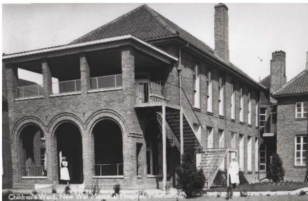
The Childrens Ward opened in 1929